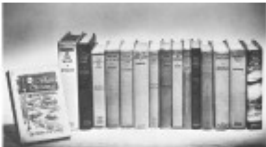
"Souvenir Photo collection - M.J.G. McMullen

Women in Manitoba were the first in Canada to have the right to vote in a Provincial Election.